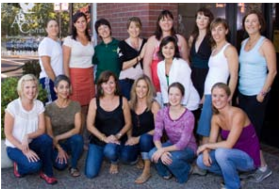
The Absolute Center staff

For more information about Absolute Center and Paying it Forward , or for class schedules, email inquiries@absolutecenter.net or call 925-299-9642. Absolute Center is located at 3658 Mt. Diablo Blvd. in Lafayette.